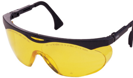
Figure 2 LSK style daily use goggle.