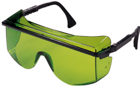
Figure 1 LOTG style daily use goggle.