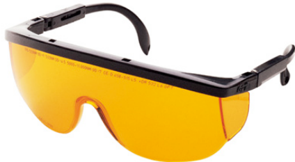
Figure 3 LGF style alignment goggle.