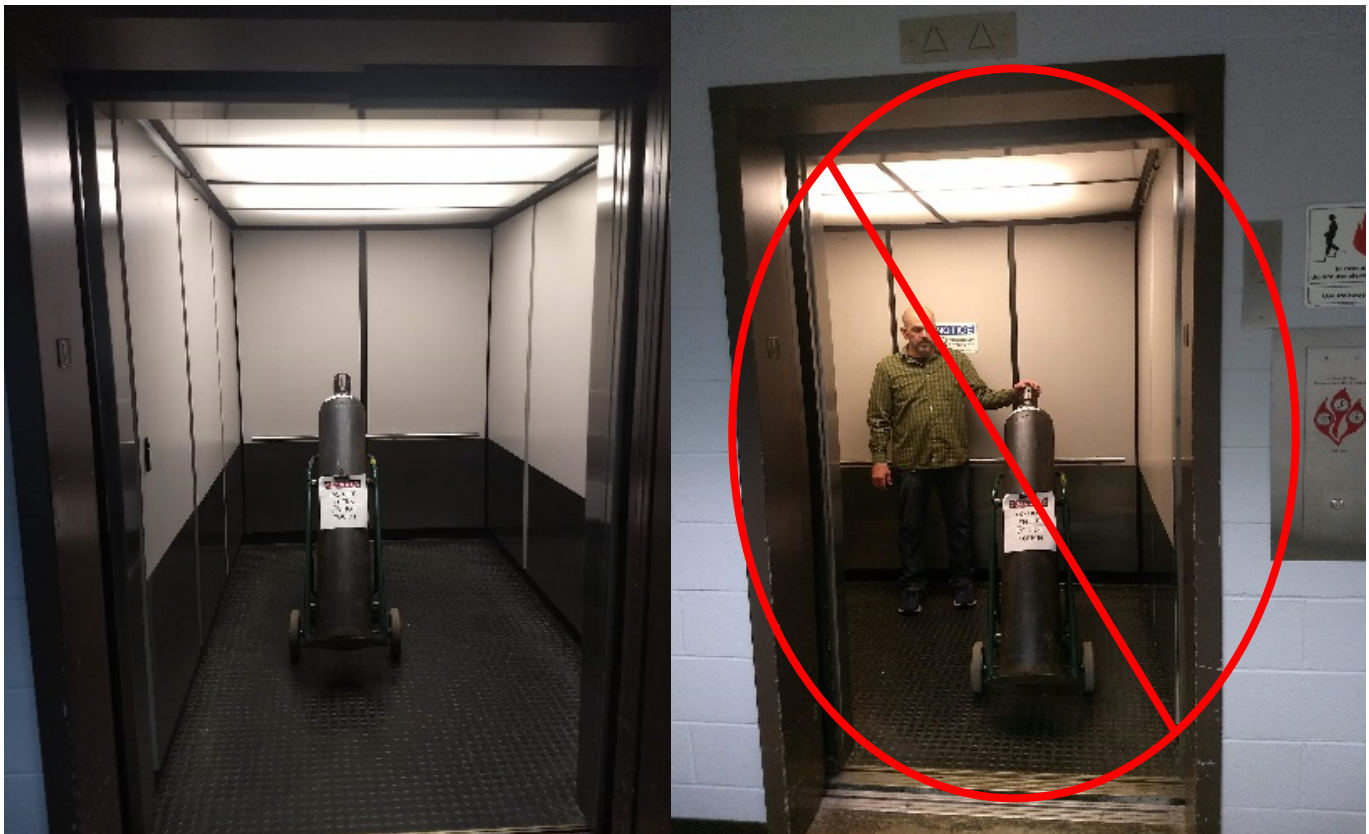
Figure 3: Cylinder Transport in Elevators