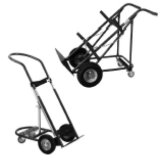
Figure 2: Typical Cylinder Hand Trucks