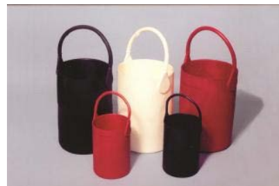
Figure 1: Handheld safety tote carrier

Do not attempt to move outdated ethers or other potentially unstable/reactive compounds. Chemicals that are outdated and potentially unstable; in corroded containers; having cracked or missing lids; unknown/unlabeled should be properly disposed of through EHS and NOT moved or relocated. Do not move chemical waste.